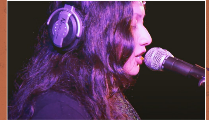
LIVE - SHANTI / Toulon