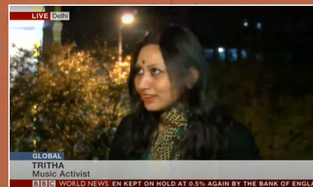
INTERVIEW - BBC World News