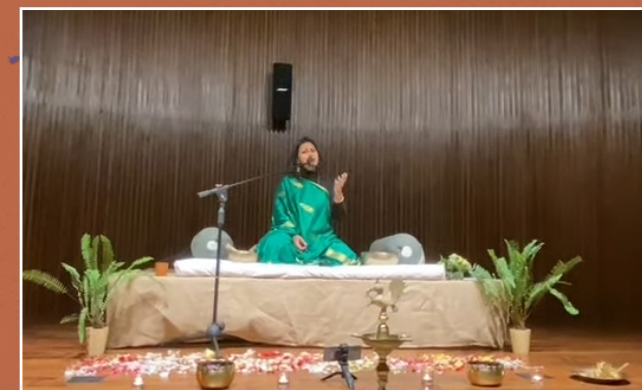
LIVE - Naad Yoga Recital 2024