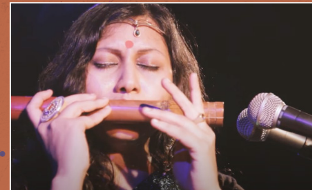
LIVE - GANAPATI / Toulon