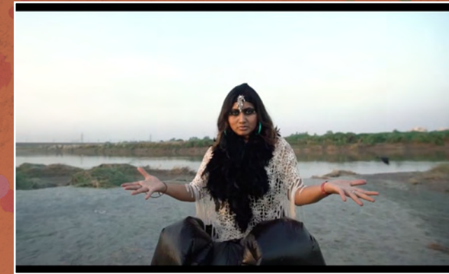
CLIP - Pachamama