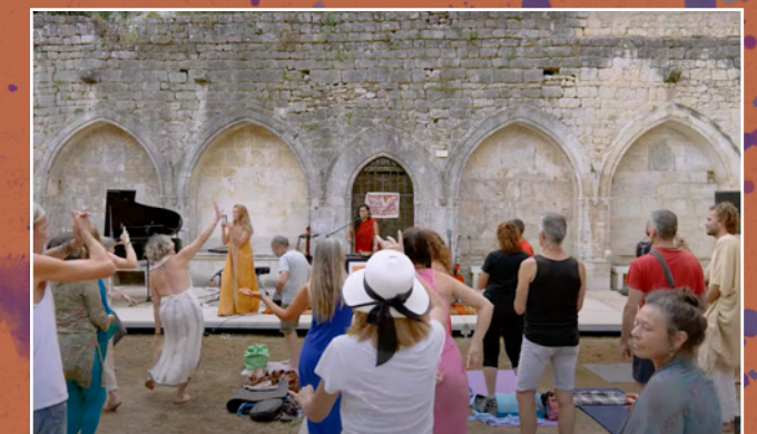
LIVE - Peacock Garden Remix South of France