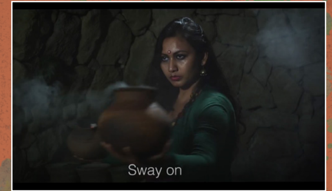
CLIP - Rangamati